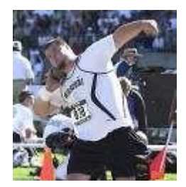
Figure 2 - Put weight onto back leg with hand not holding shot pointing to where it will be gong